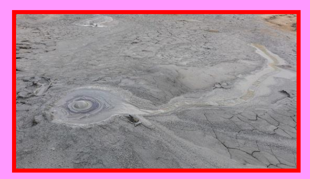
A bubble of gas

The presence of the so-called "muddy volcanos" located in the Buzau county, near the village of Berca is interesting. Not as spectacular as real volcanos, but still an interesting phenomena. These so-called volcanoes are active all the time, which means gas is pushing mud to the surface in a continuous way, but at low speeds.