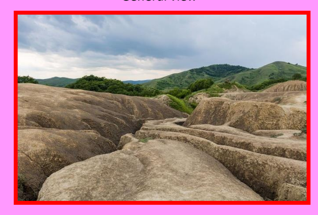
Landscape formed by the mud flows