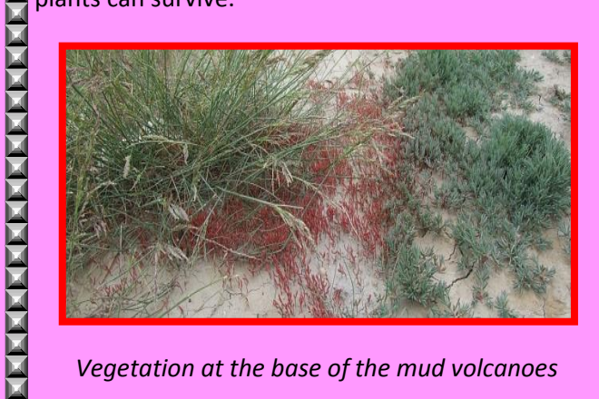
Vegetation at the base of the mud volcanoes

The mud volcanoes create a strange lunar The mud voicanoes create a strange can landscape, due to the absence of vegetation around the cones. Vegetation is scarce because the soil is very salty, an environmental condition in which few plants can survive.